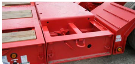
Optional Rolling Bunk - Side View