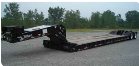
Industry Leading 20 in. Loaded Deck Height

Various Options Available Upon Request. Specifications Subject To Change Without Notice.