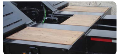
Optional "RA" - Removable Rear Bridge